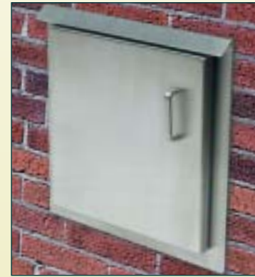
MODEL SPR3 SHOWN