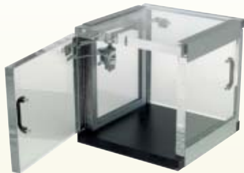
Left Hand Model (Customer's Side)