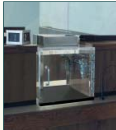
Right Hand Model (Customer's Side)

The Clear Package Receiver is designed for interior use only. Satin finish aluminum extrusions are used to fasten the sides and bottom together. Bottom is constructed of plywood and bullet resistant fiberglass covered with plastic laminate. A special interlocking mechanism allows only one door to open at a time. Closer furnished on customer side door. Contents can be clearly viewed from the top and all four sides. Handing is determined by hinge placement on customer's side. Inside Dimensions: 13-5/16" wide x 12-1/2" deep x 13-3/8" high.