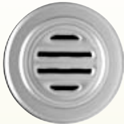
549 Series Chrome Plated Brass