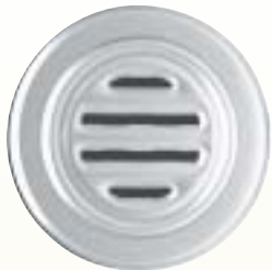
834 Series Aluminum Construction